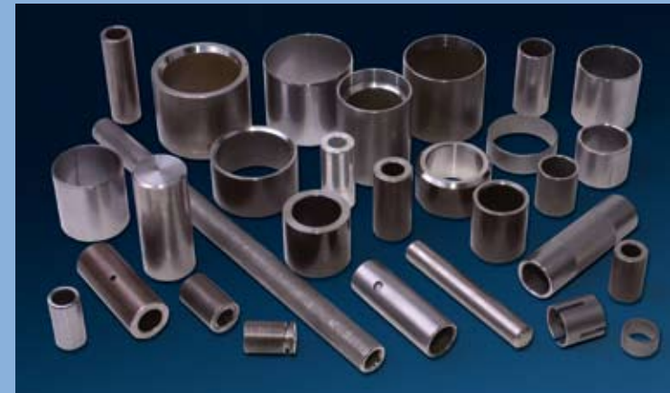
Tubular Parts and Metal Fabricating for Industry

Perfect Cut-Off, Inc. is committed to "Total Customer Satisfaction" as a world-class supplier of cut steel tubing products. Continuous improvement with total employee involvement is the concept which we will use in striving for excellence in all areas of the business.