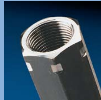
I.D. Threading/Identification Mark