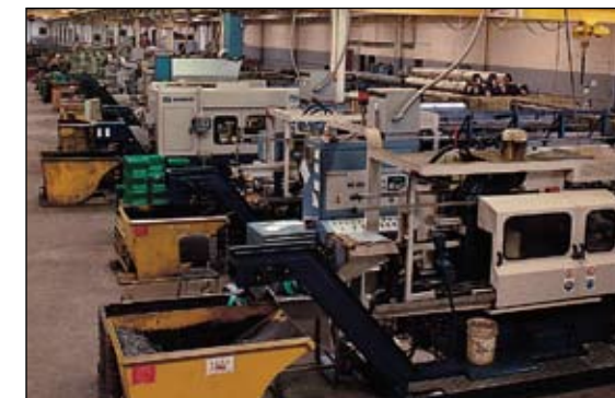
Expanded Equipment Capability: 26 state-of-the-art cutting and end finishing transfer machines.

Integrity, Reliability, Commitment and Quality are what Perfect Cut-Off customers experience with each order. We go to great lengths to solve our customer's part problems. Come to us with your current challenges and let us help you solve your part problems. We meet the most demanding challenges, even if it means modifying the equipment to make your part. It's time to start putting our diverse, state-of-the-art resources to work for you.