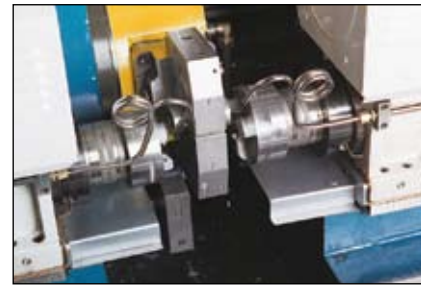
State-of-the-art cutting machines perform multiple operations efficiently and precisely

When in the market for high-production tube cut-off, we have the state-of-the-art equipment to get your job done economically and efficiently every time. Whatever your material requirement is, high or low ferrous and non-ferrous metals, our highly skilled work force coupled with our state-of-the-art technology guarantees consistently close length tolerances. Our equipment allows us to perform complicated, multiple operations on one machine!