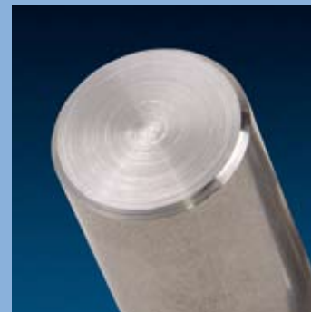
Clean-cut face on solid bars; no center tip remaining